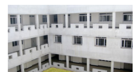
Building Inner view